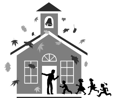
Charter schools was the topic of concern at the ESPNA June meeting.