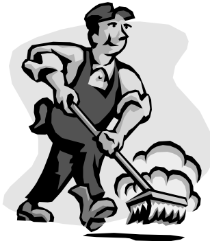
ESPNA sponsors the first annual neighborhood clean-up project.

hour project time. The total amount of refuse, collected in that 3 hour time span, came to over 4 tons .