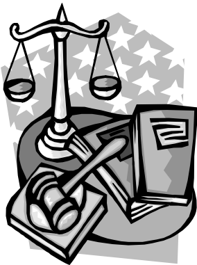
The ESPNA intends to sponsor educational forums concerning our criminal justice system.

“ Our intention is to pursue every legal prospect possible to insure not only the safety of our neighbors but members of our community as well.”