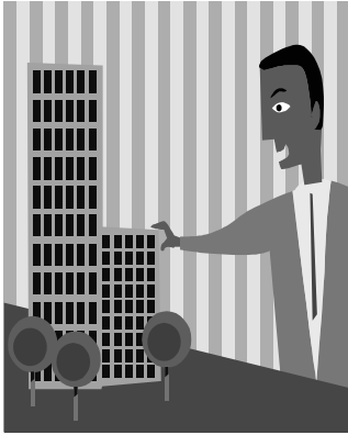
A renowned local developer wants to transform Town Hall Estates into an affordable apartment complex.